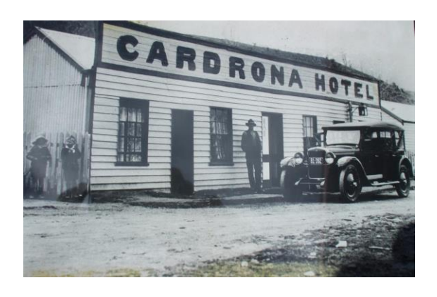
Cardrona Hotel - 1930's?